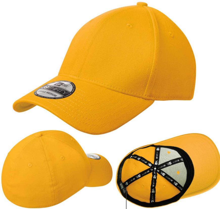
NEW ERA® taping on inside seams